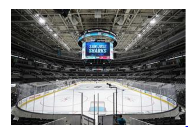
Daktronics Centerhung