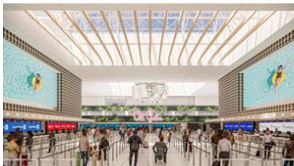
Rendering of Daktronics displays at LAX